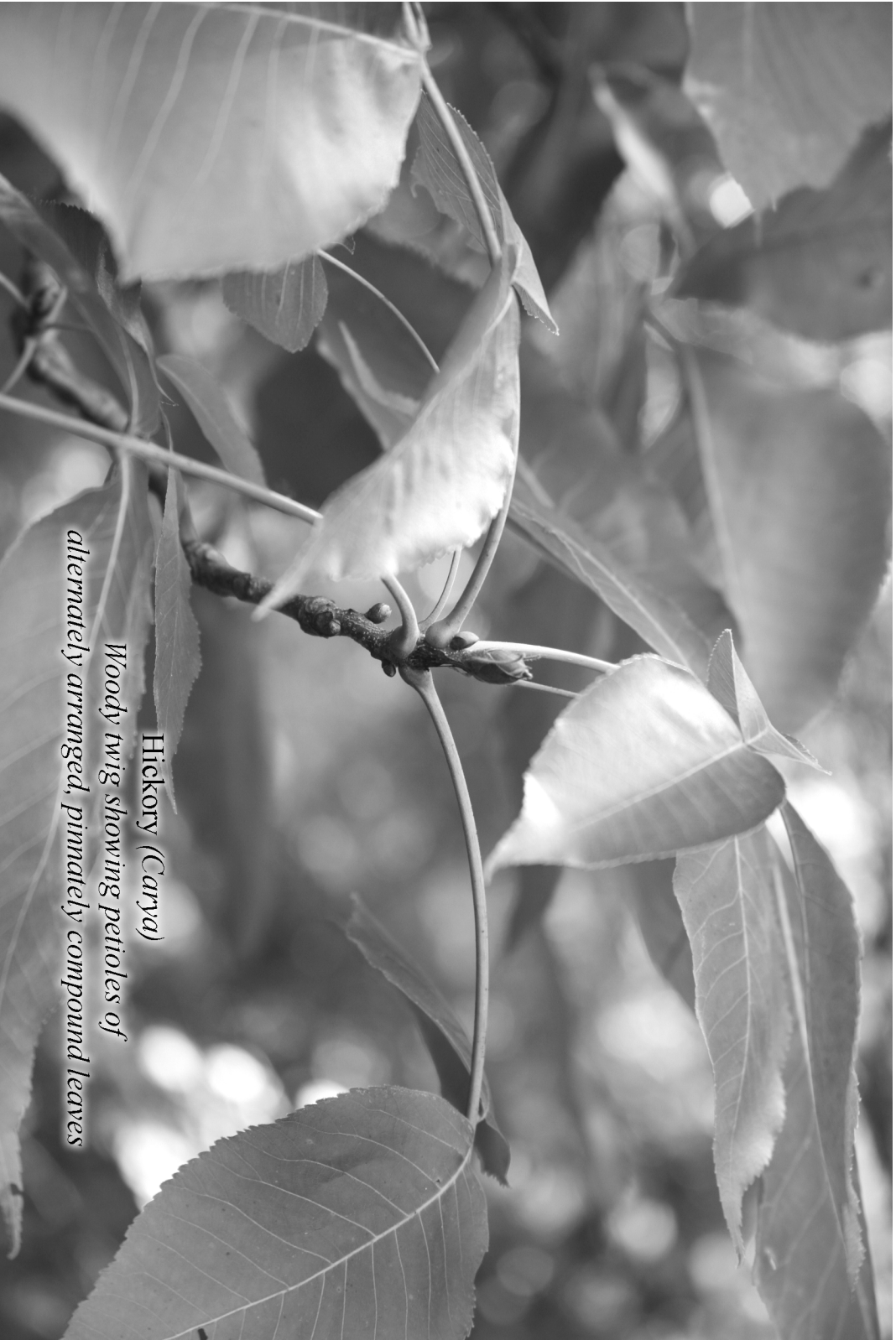
Hickory ( Carya ) Woody twig showing petioles of alternately arranged, pinnately compound leaves