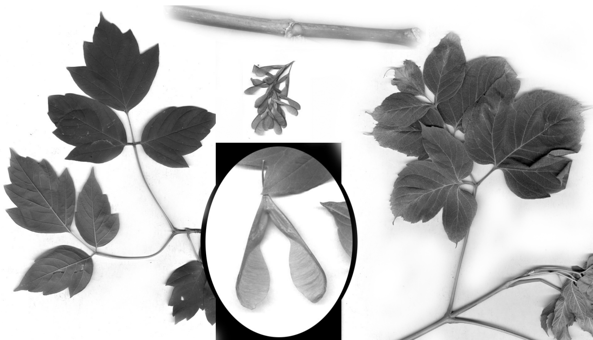
Acer negundo - Box Elder

You will use these keys outside in discussion to identify common trees and shrubs on campus.